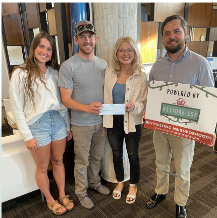
Our Last DPA of 2024