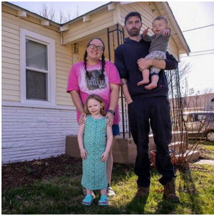
Our First DPA of 2024